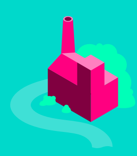
Derby has a World Heritage Site and is home to the world's first factory.

25% of Derby's population are from ethnic minority backgrounds.